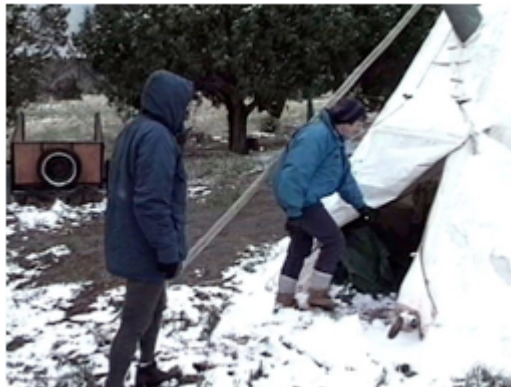
One woman can't afford a healthy house and sleeps in a teepee.

We also see how people who do not have the financial means to build a healthy house have to cope. One owns a regular house she has improved on, but still has to sleep in a tent and a teepee out in the yard, despite the brutal winter. Another has lived in a van for a long time, though recently was able to rent a room from another woman with MCS. We also visit an MCS trailer park near Questa, New Mexico, that looks very depressing. The owner tells about all the suicides, but also the many people who have used the trailer park as a stepping stone to something better.