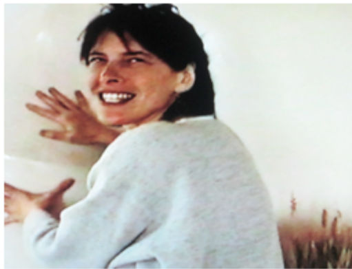
Abod feels so good with the plaster walls in the Baker-Laporte home.