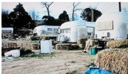
The Questa MCS trailer park. It has since closed.

We also see how people who do not have the financial means to build a healthy house have to cope. One owns a regular house she has improved on, but still has to sleep in a tent and a teepee out in the yard, despite the brutal winter. Another has lived in a van for a long time, though recently was able to rent a room from another woman with MCS. We also visit an MCS trailer park near Questa, New Mexico, that looks very depressing. The owner tells about all the suicides, but also the many people who have used the trailer park as a stepping stone to something better.